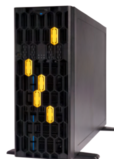
Option Front Bezel*