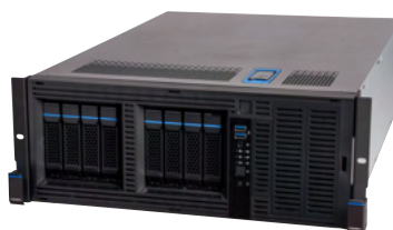
Option Ears & Rail Kit